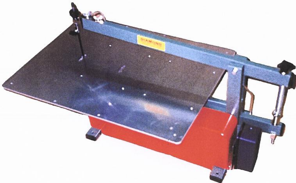
THE TABLE IN THE NORMAL POSITION